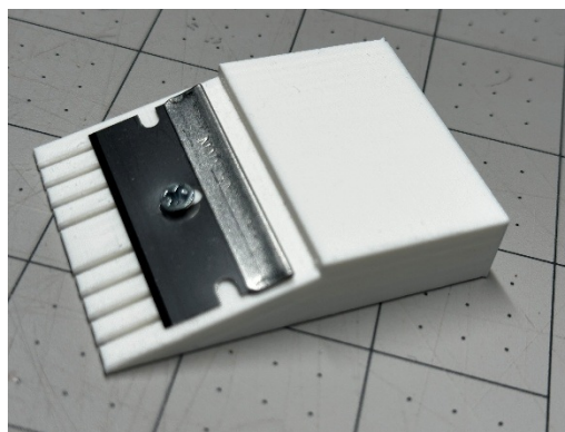
3D Version of Higley Trimming Tool

I've a couple of gadgets that kit and ARF builders might find interesting. First during the March covering workshop Terry Terreniore used a Harry Higley film trimming tool to great effect. This tool which is seemingly now out of production is used to trim covering along straight edges (wings, fuselage sides, etc.) and produces clean straight edges where an overlapped seam is needed, like a wing's leading or trailing edge. I've only found this tool listed online at A&E RC Products. It is not clear whether A&E is just selling off Higley stock or if they are continuing with Harry Higley product production. As of this writing they have not confirmed the stock status of this tool. So, with the possibility that this tool is now relegated to second hand and swap meet transactions, I fired up my 3d printing software and made the tool shown. I can provide the "STL" Slicer input file for anyone interested. You would need to provide your own razor blade and blade screw to complete the tool.