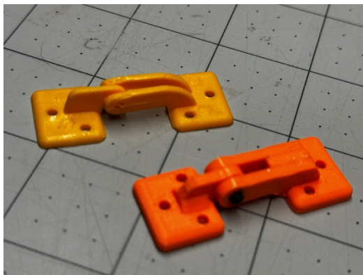
ARF and 3D “Split Flap” Hinges